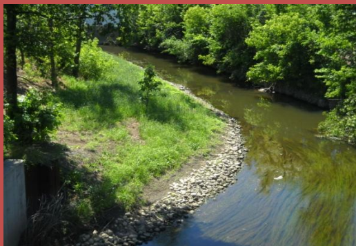
Top: Location of West Fork Green Bottom: Stabilization around the east bank of the river