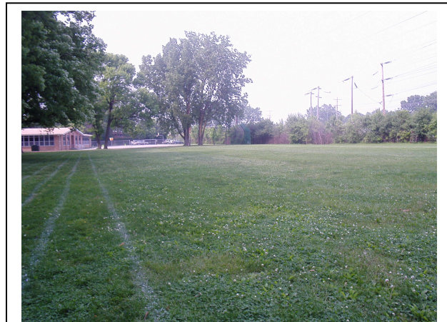
School turf playfields and buildings.

Existing Ecological Conditions: In east Glenview, the Avoca School grounds contain an oak-dominated grove of trees with a turf understory known collectively as Harriett Ostlund Park. Clustered generally in groups of the same species are red oak, white oak, and bur oak, with scattered basswood, ash, and cottonwood. Shallow and barely noticeable swales meander through the trees at the park's west and east ends.