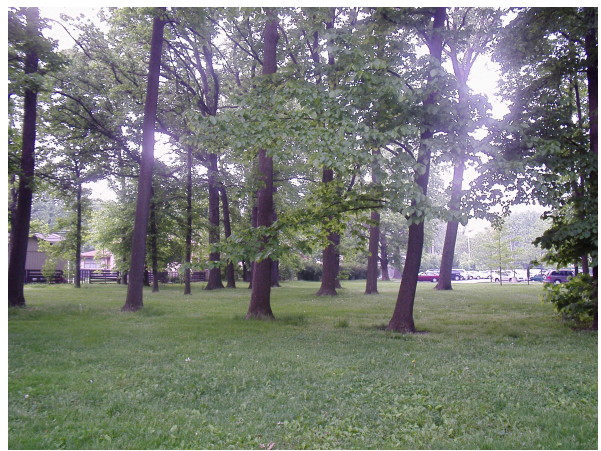
Mature oak woodland trees with turf understory.

Developed (4.41 acres): Playground equipment and school grounds on north half of site.