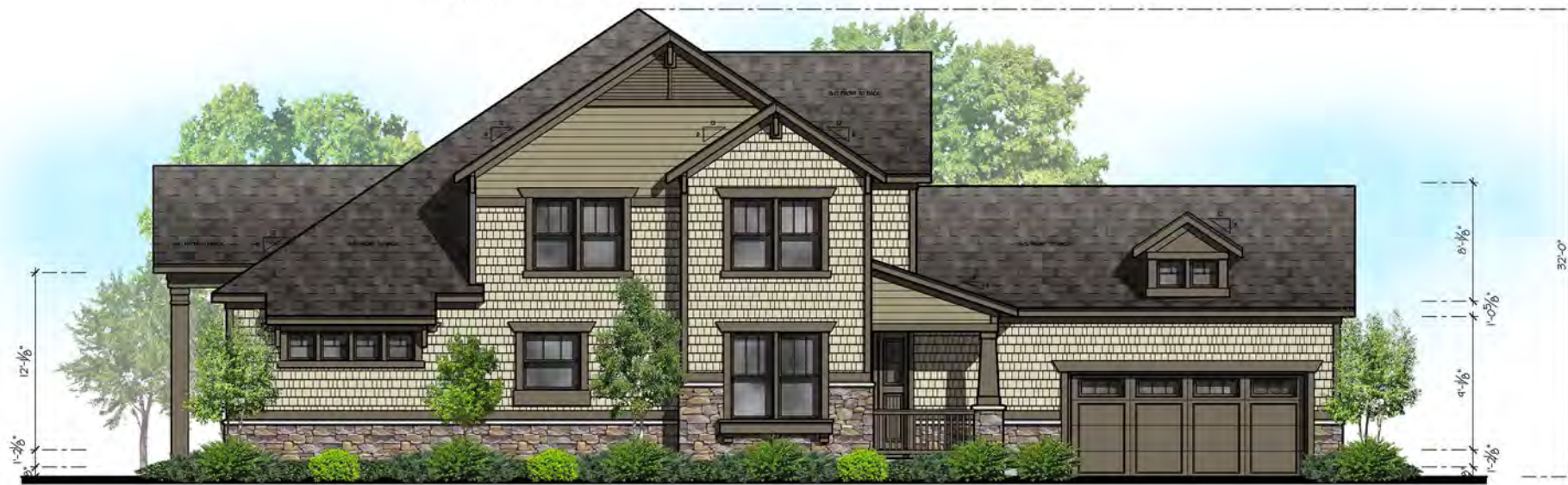
Craftsman Style Elevation Front Elevation