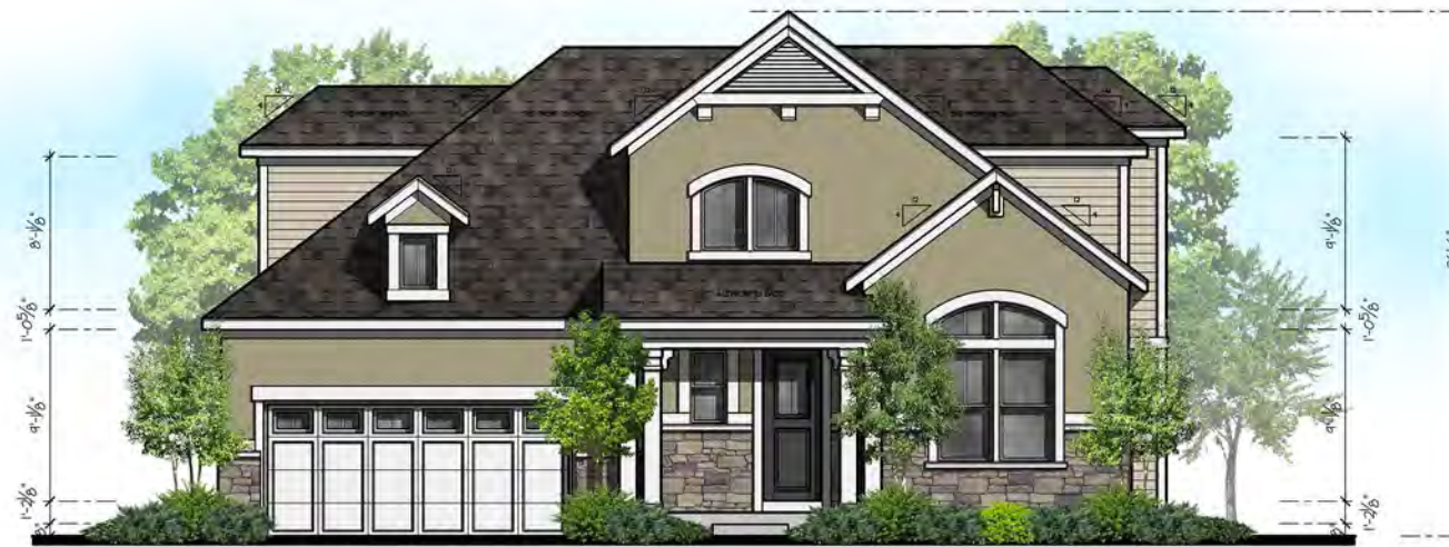
French Country Style Elevation Front Elevation SCALE: 3/8"=1'-0"