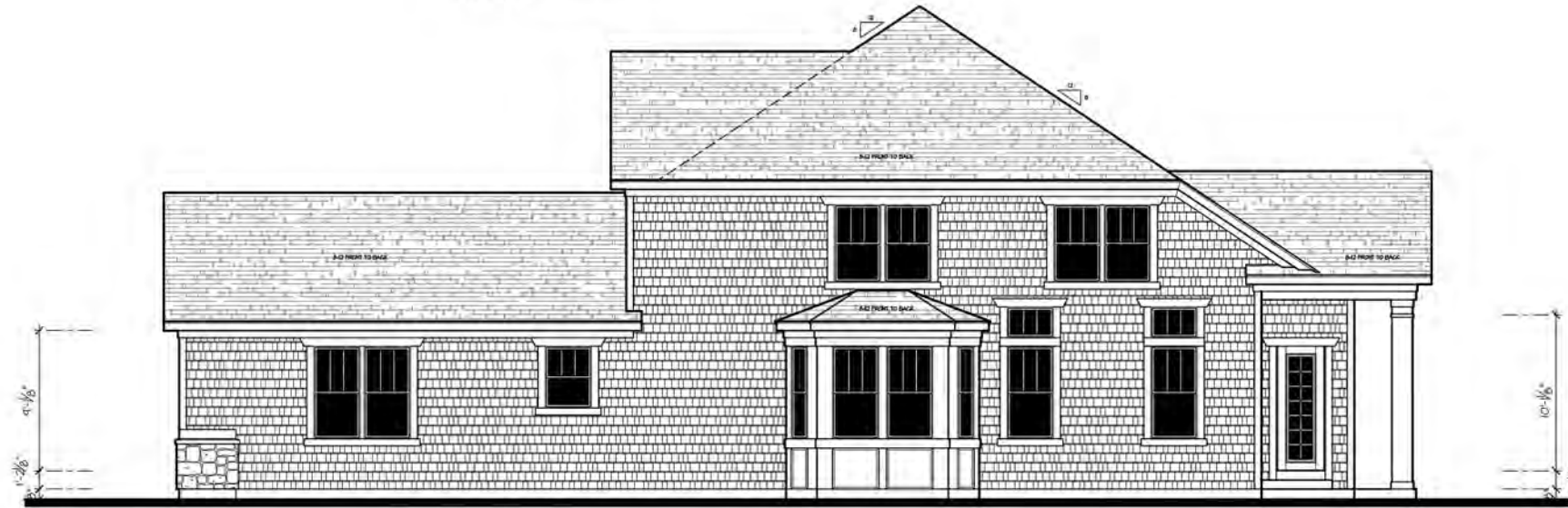
Craftsman Style Elevation Rear Elevation SCALE: 3/8"=1'-0"