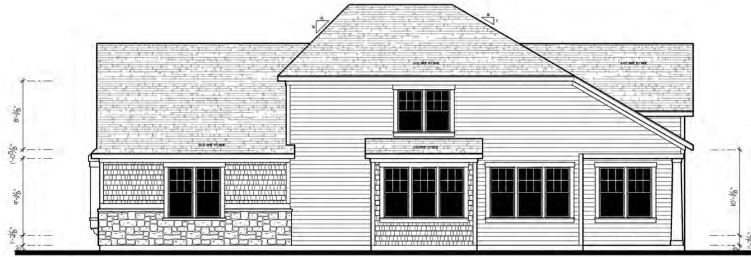
Shingle Style Elevation Right Elevation