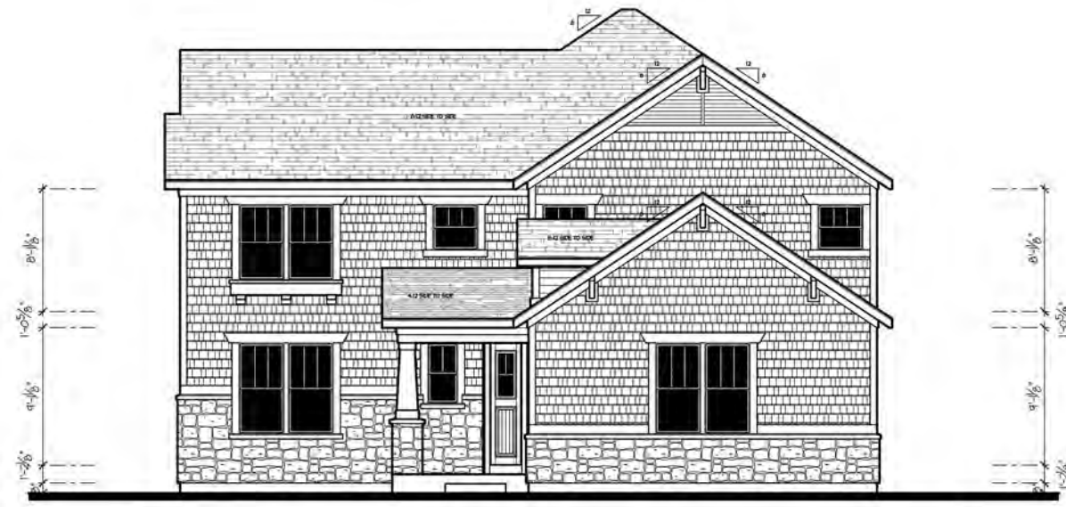
Craftsman Style Elevation Right Elevation SCALE: 3/8"=1'-0"