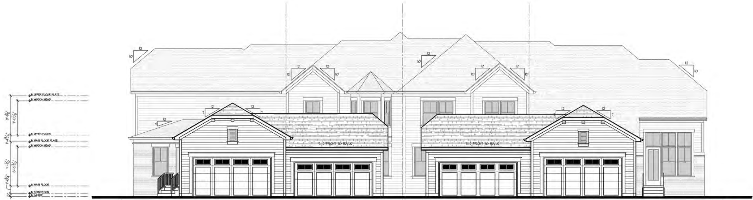
Old English Style Elevation Rear Elevation SCALE: 3/8"=1'-0"