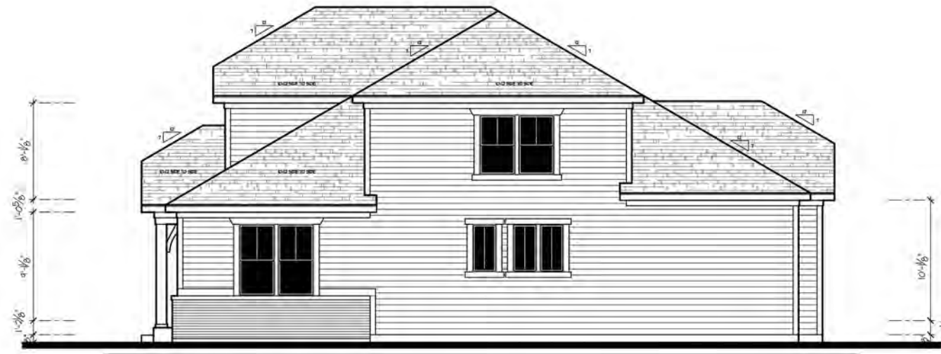
Old English Style Elevation Right Elevation SCALE: 3/8"=1'-0"