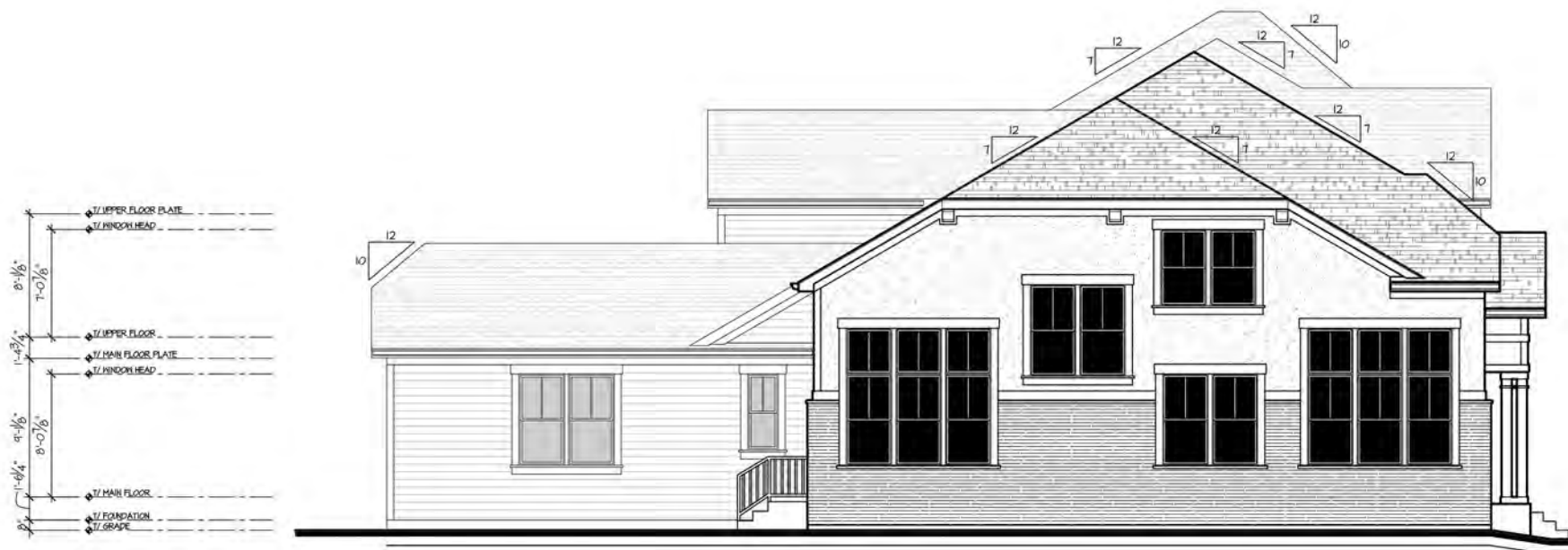
Old English Style Elevation Left Elevation SCALE: 3/8"=1'-0"