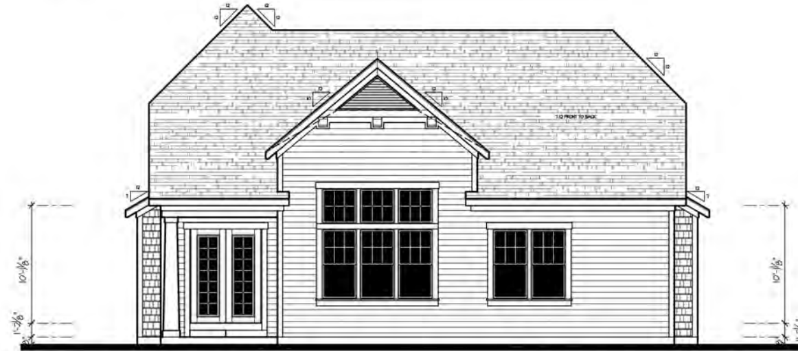
Shingle Style Elevation Rear Elevation