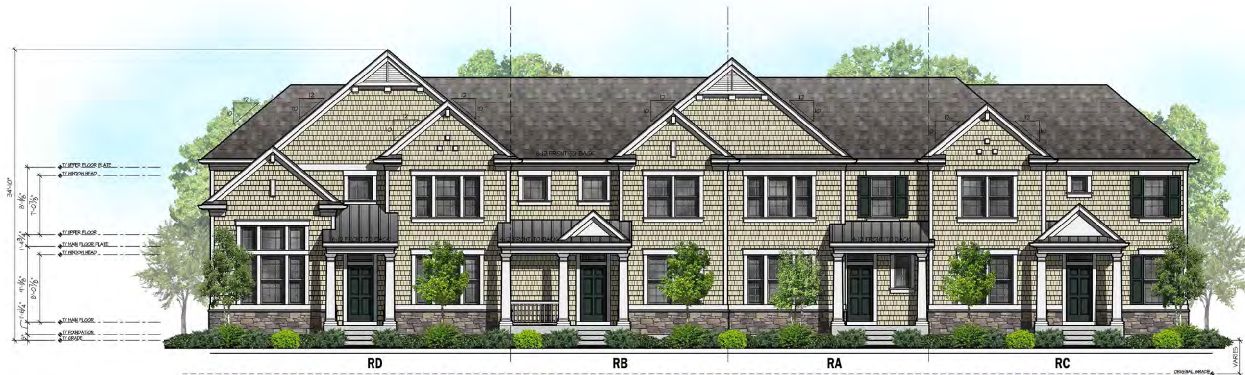
Shingle Style Elevation Front Elevation SCALE: 3/8"=1'-0"