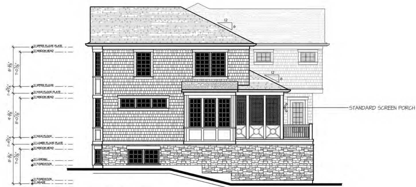
Shingle Style Elevation Right Elevation