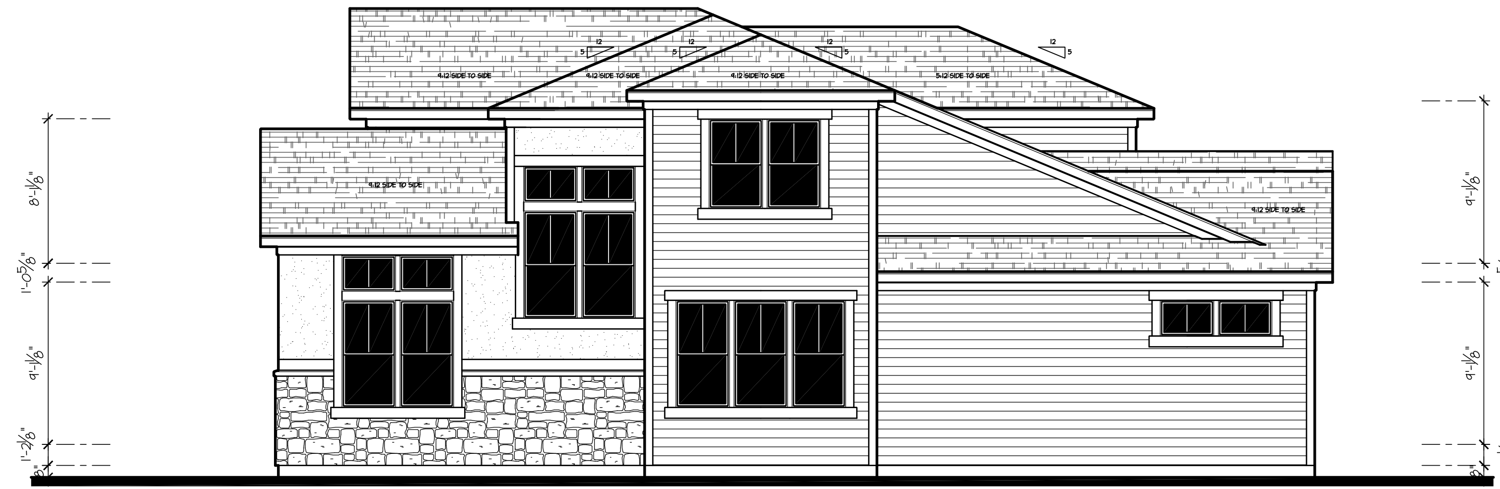
French Country Style Elevation Right Elevation