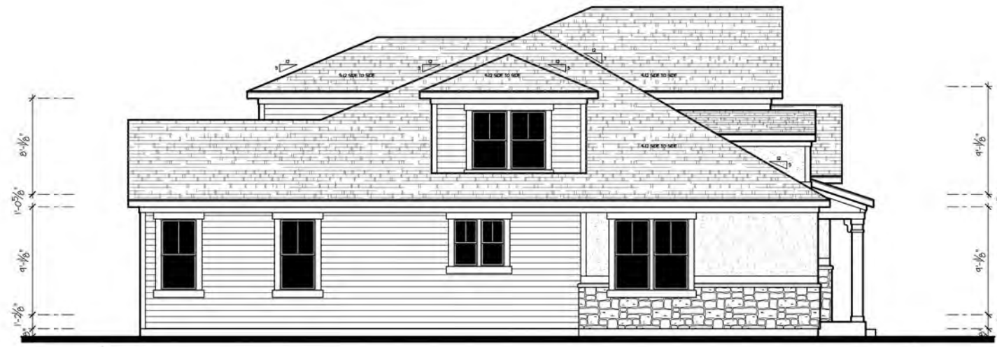
French Country Style Elevation Left Elevation SCALE: 3/8"=1'-0"