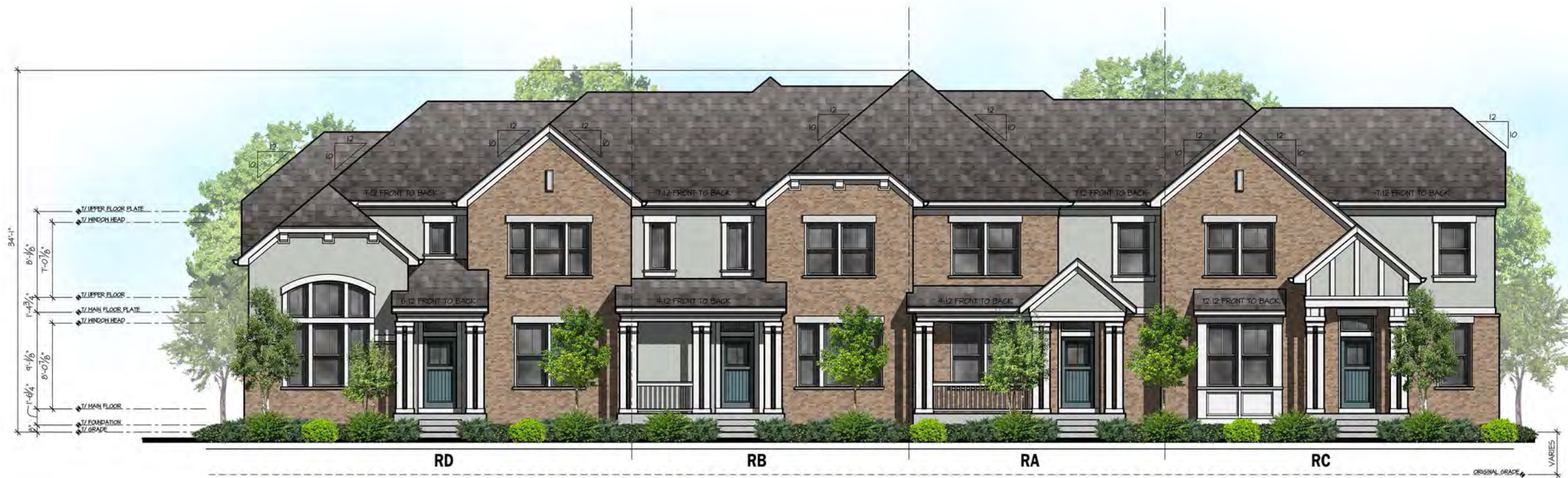
Old English Style Elevation Front Elevation SCALE: 3/8"=1'-0"