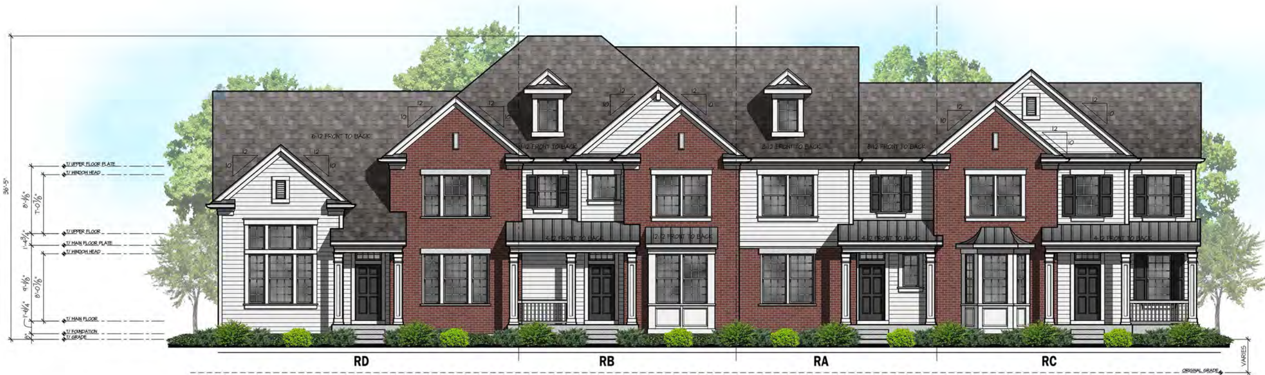
Classic Revival Style Elevation Front Elevation SCALE: 3/8"=1'-0"