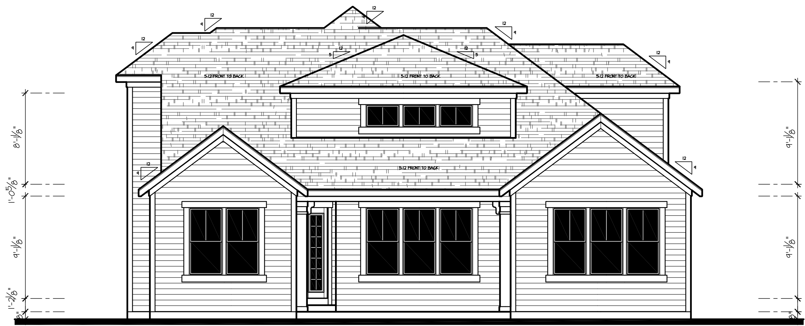
French Country Style Elevation Rear Elevation