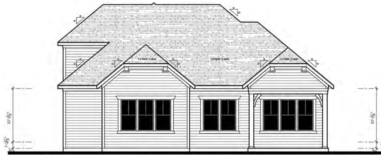
Old English Style Elevation Rear Elevation SCALE: 3/8"=1'-0"