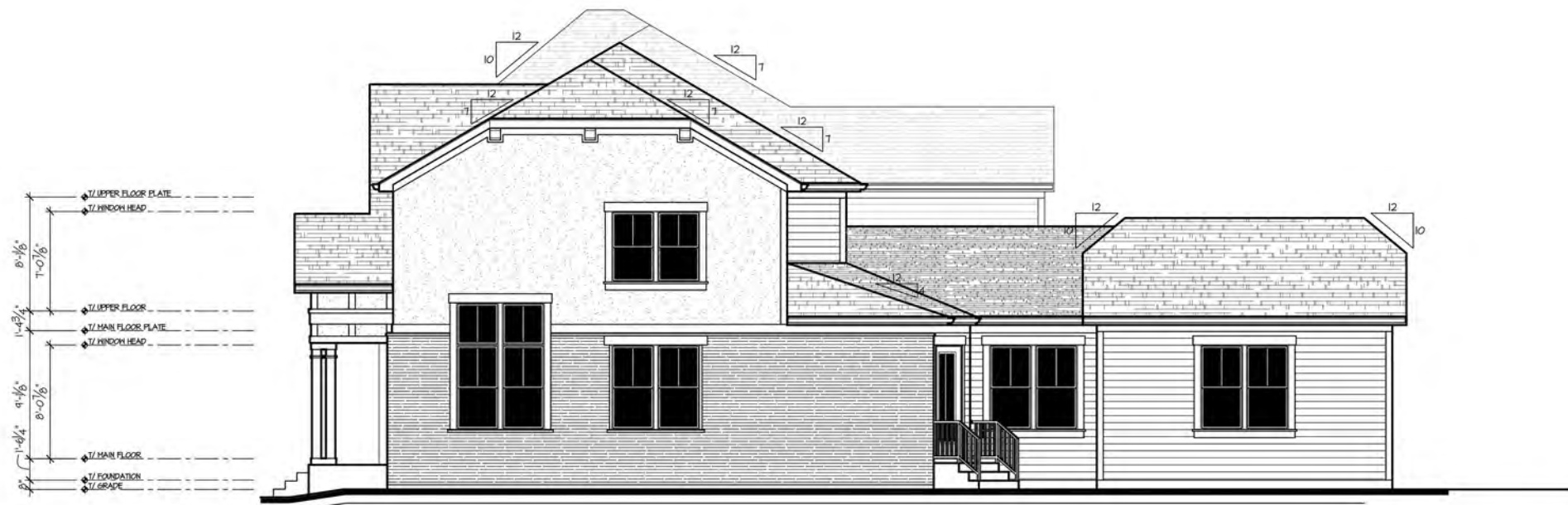
Old English Style Elevation Right Elevation SCALE: 3/8"=1'-0"