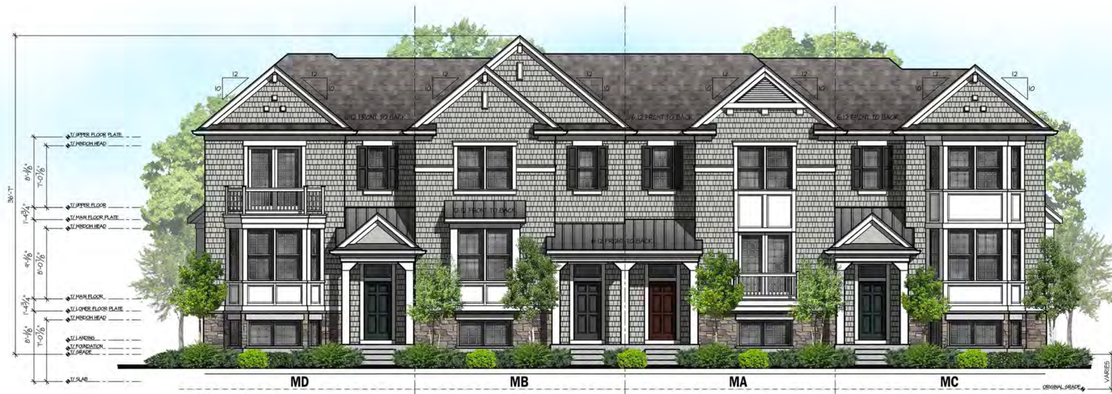
Shingle Style Elevation Front Elevation