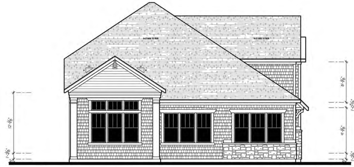
Craftsman Style Elevation Left Elevation