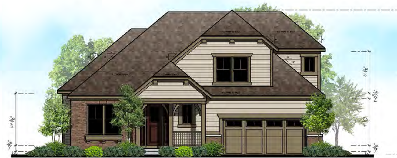
Old English Style Elevation Front Elevation SCALE: 3/8"=1'-0"