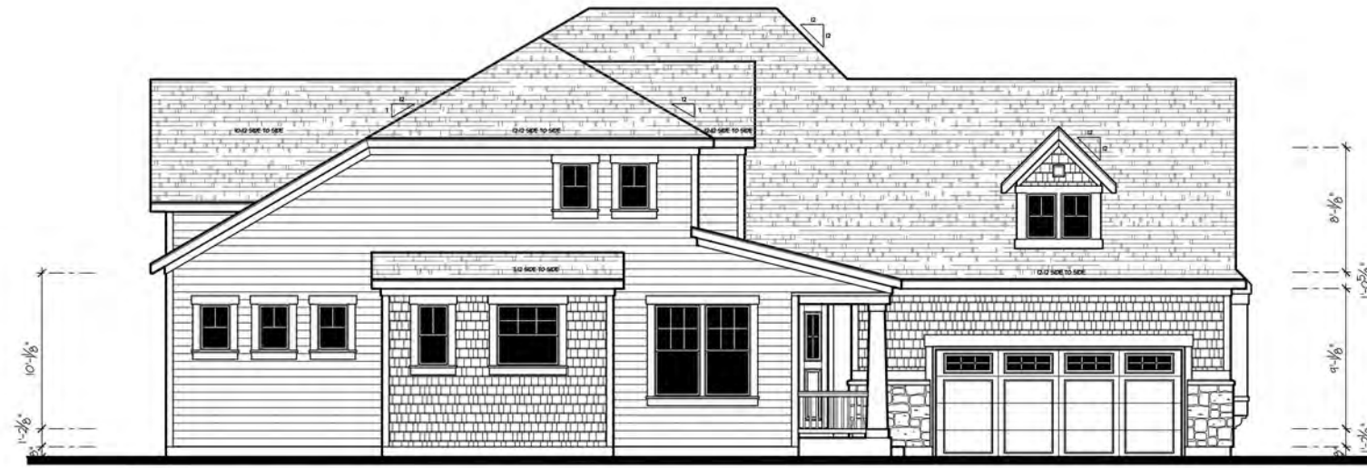
Shingle Style Elevation Left Elevation SCALE: 3/8"=1'-0"