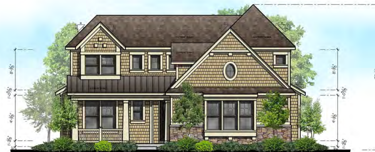
Shingle Style Elevation Front Elevation SCALE: 3/8"=1'-0"